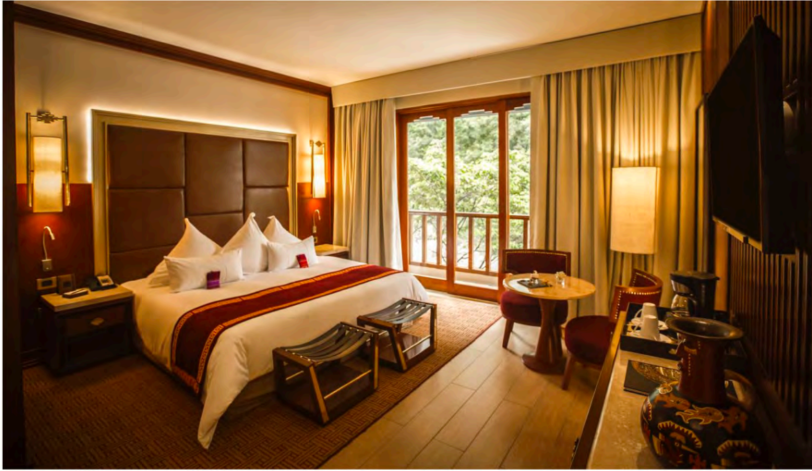
The deluxe rooms have balconies and views of the river and lush greenery.