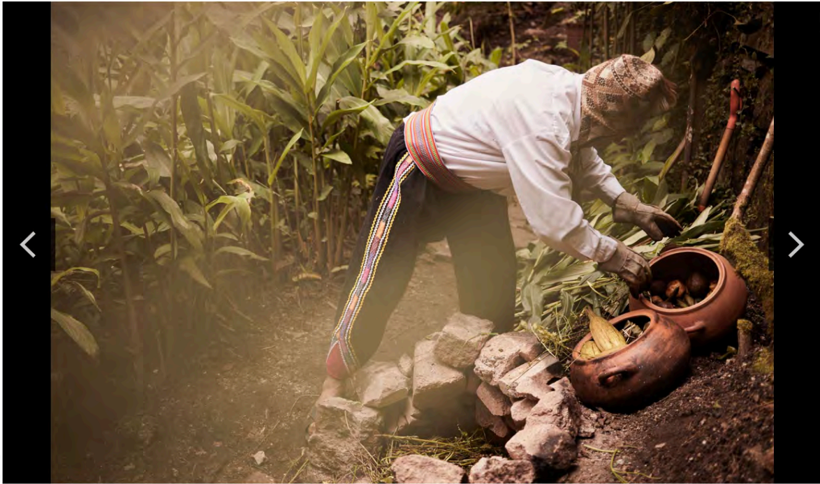
The pachamanca demonstration showcases the "earth oven" practice.