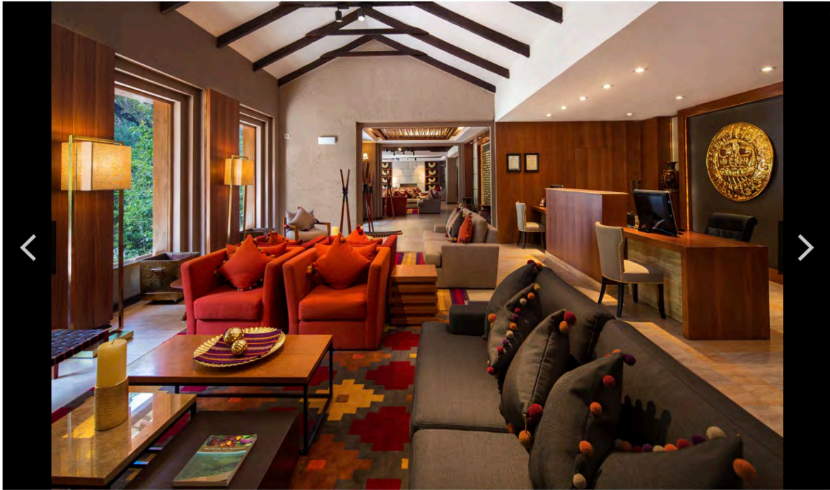
Sumaq was extensively renovated in 2016.