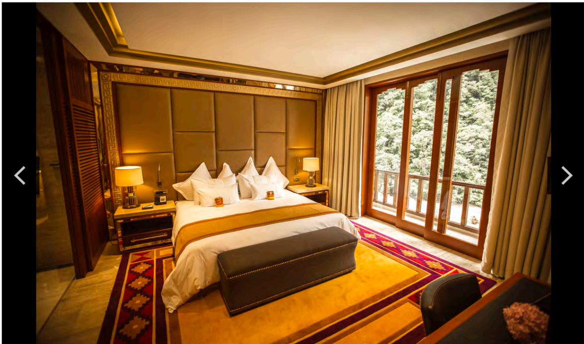
The Imperial Suite is the most lavish room.