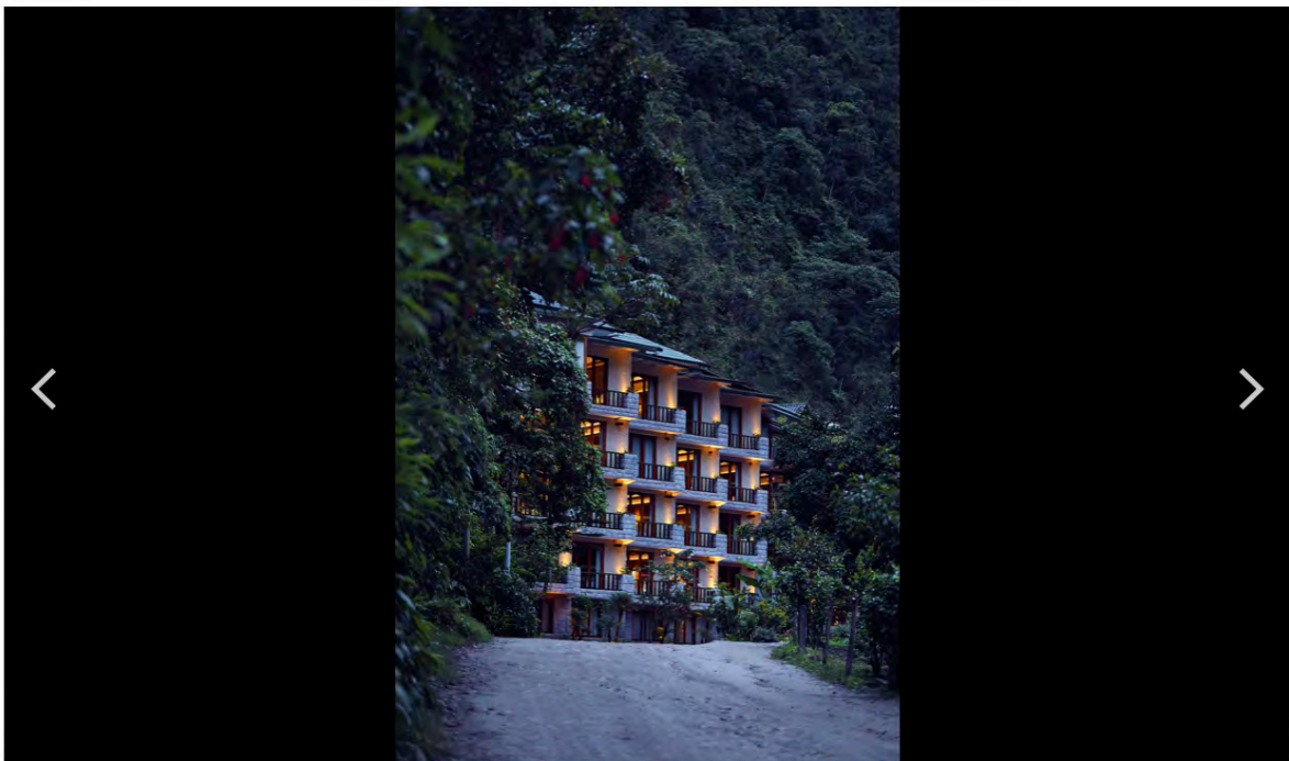
The hotel is in the perfect location.