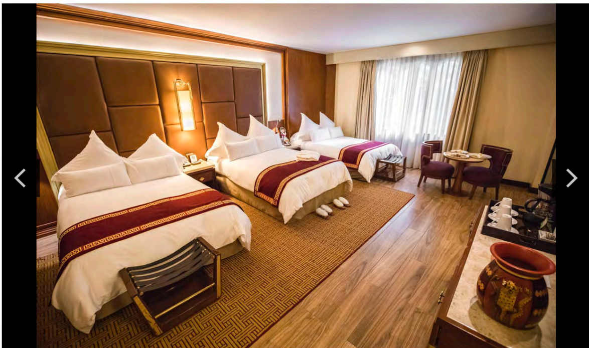
There are also rooms with three beds, for family vacations.