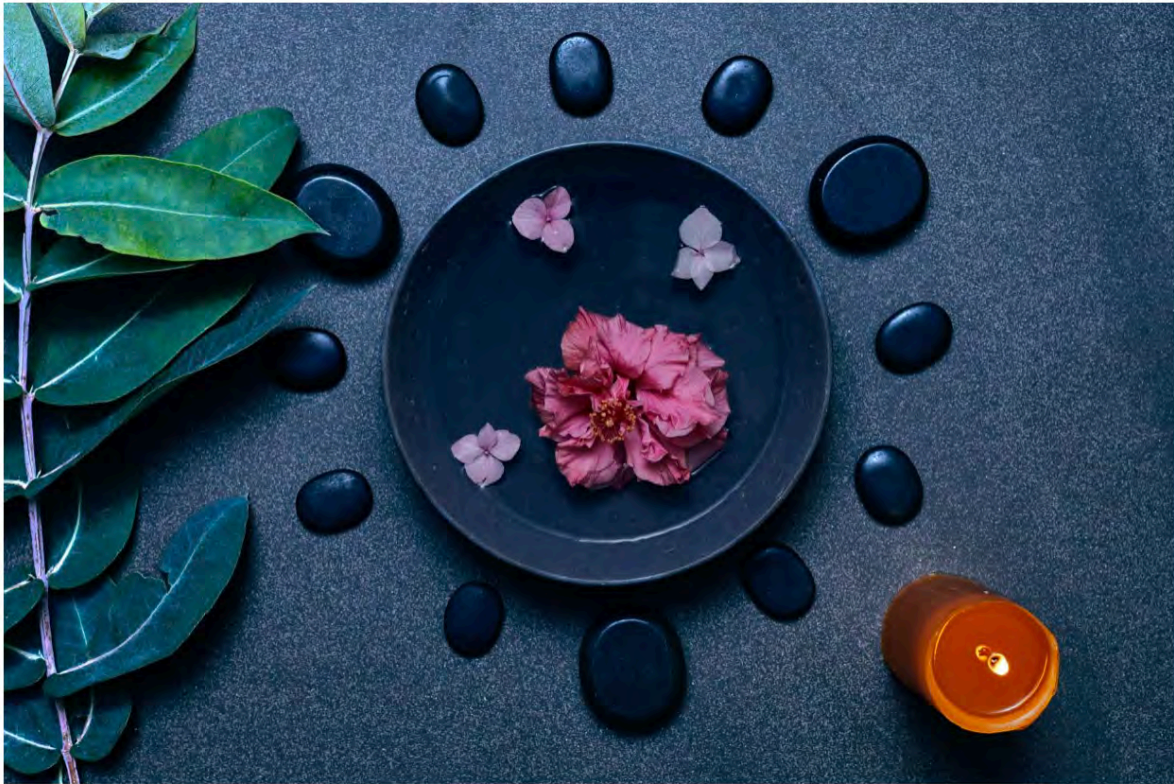
A very soothing spa moment.

If you're looking to add another level to the more spiritual experience, book the "Offer to the Earth" ritual, where the shaman who took you around Machu Picchu will come to Sumaq and perform a ceremony with an offering to the earth, including coca leaves, palo santo, crystals, shells and other items. Sumaq also offers aura cleansing sessions and coca leaf readings, both of which are completed by a private shaman.