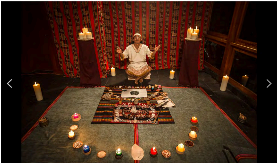
A shaman will come to the hotel for certain ceremonies and rituals.