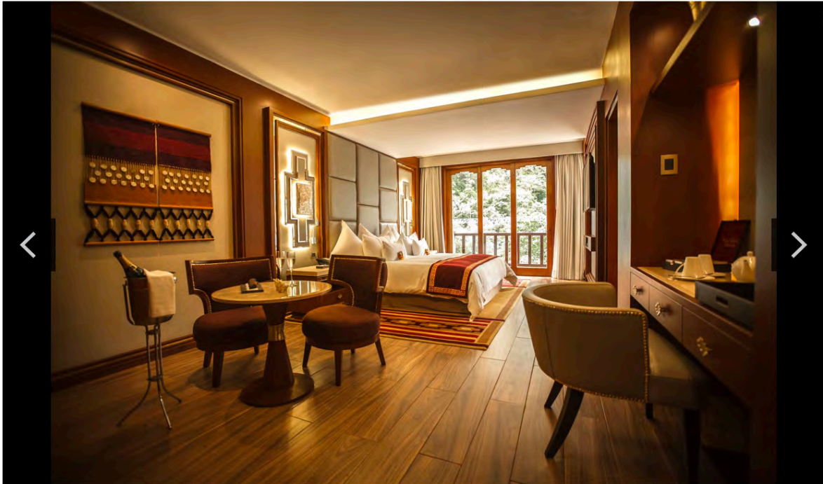
A junior deluxe suite.