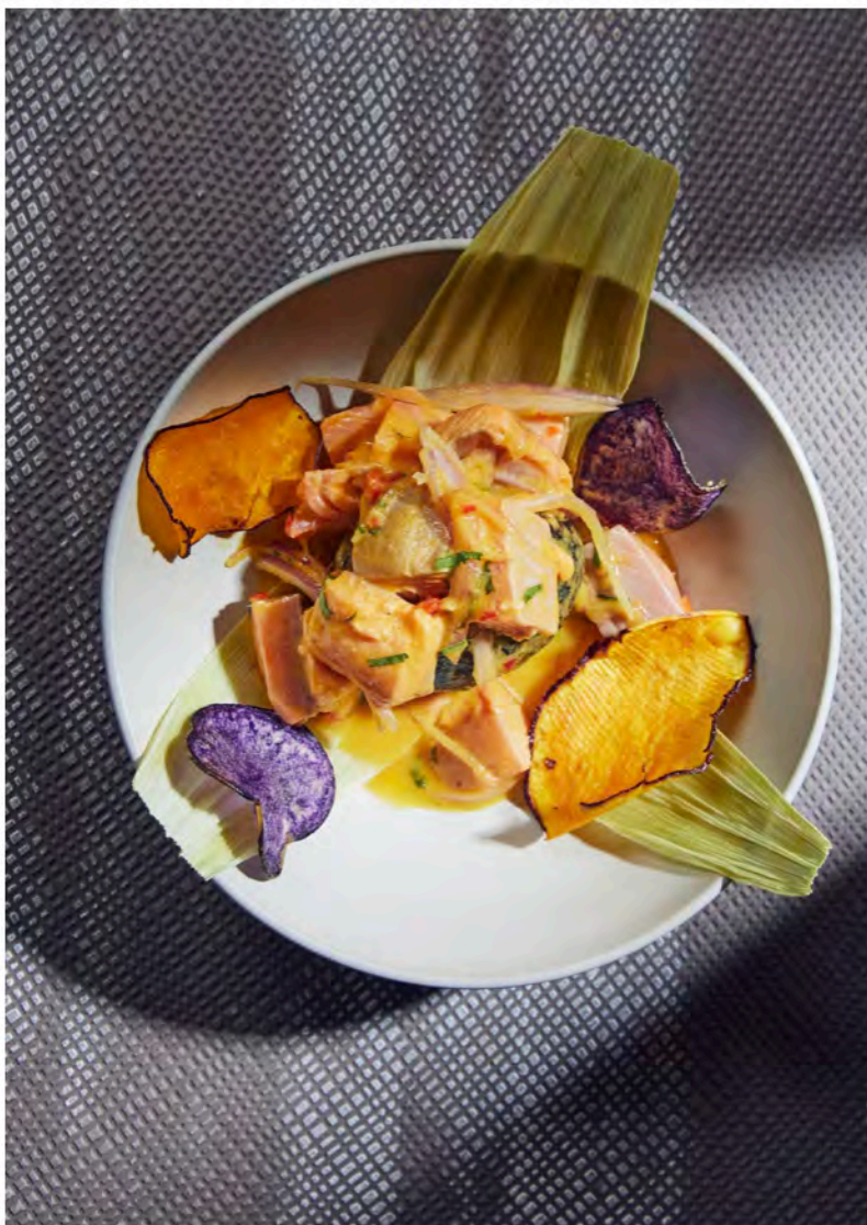
We can't promise your ceviche will turn out exactly like this.