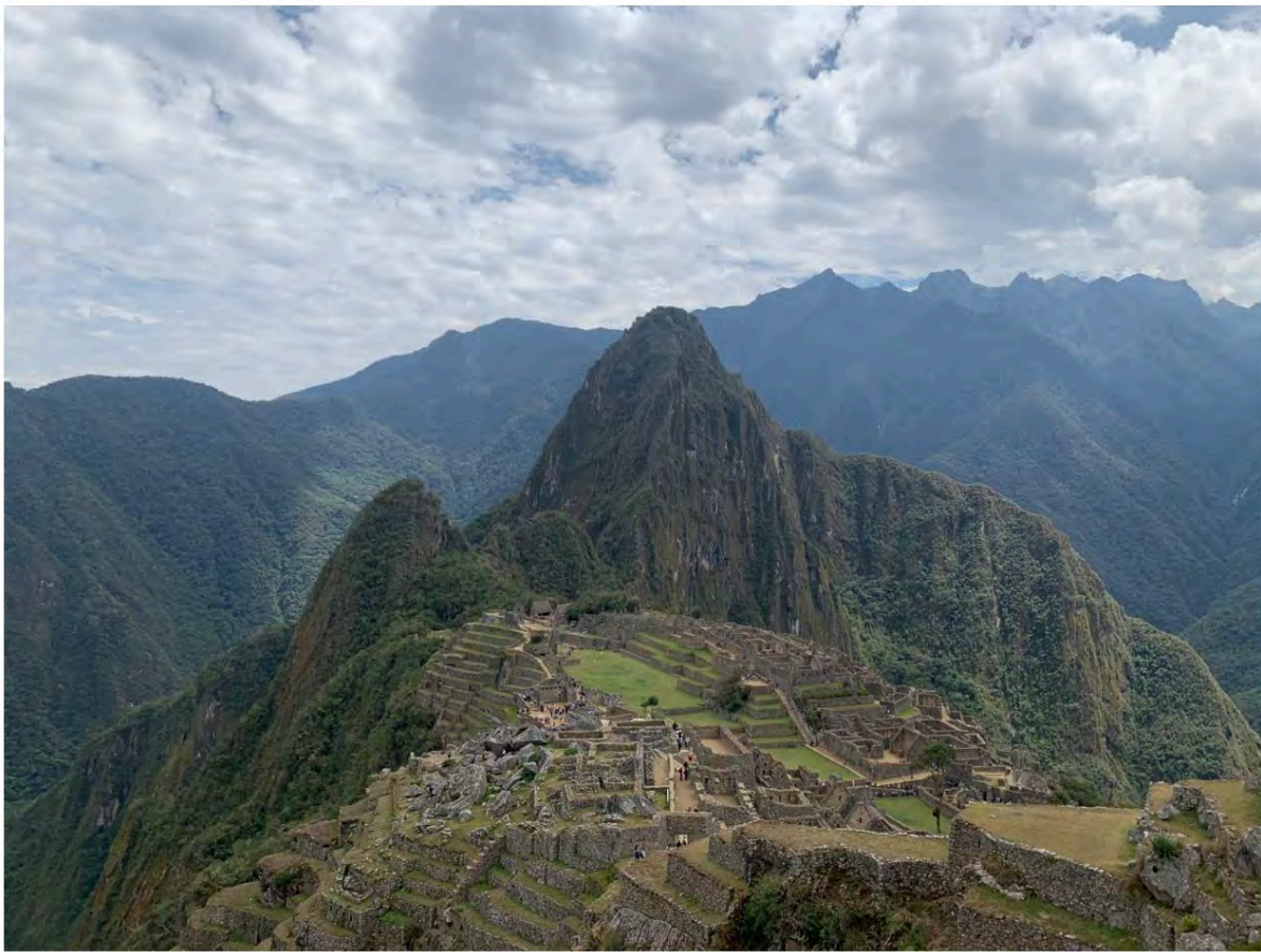
It's worth it.

If you don't mind waiting a few hours before you dine, we definitely recommend the pachamanca demonstration. It's an ancient Peruvian dish in which stones are heated in a fire and then buried in the ground and act as an oven (an "earth pot"), and food including pork, chicken and potatoes are then buried in the earth with it, underneath a few layers of plantain leaves. If you're looking for a simpler meal, the hotel's one restaurant, Qunuq, is open for breakfast, lunch and dinner, with Peruvian dishes and local ingredients like quinoa chicken, trout ceviche and alpaca. You can also go for the Flavor of the Andes tasting menu, to try a little bit of everything.