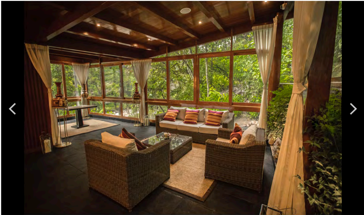
The hotel will organize a private dinner on the terrace for guests.