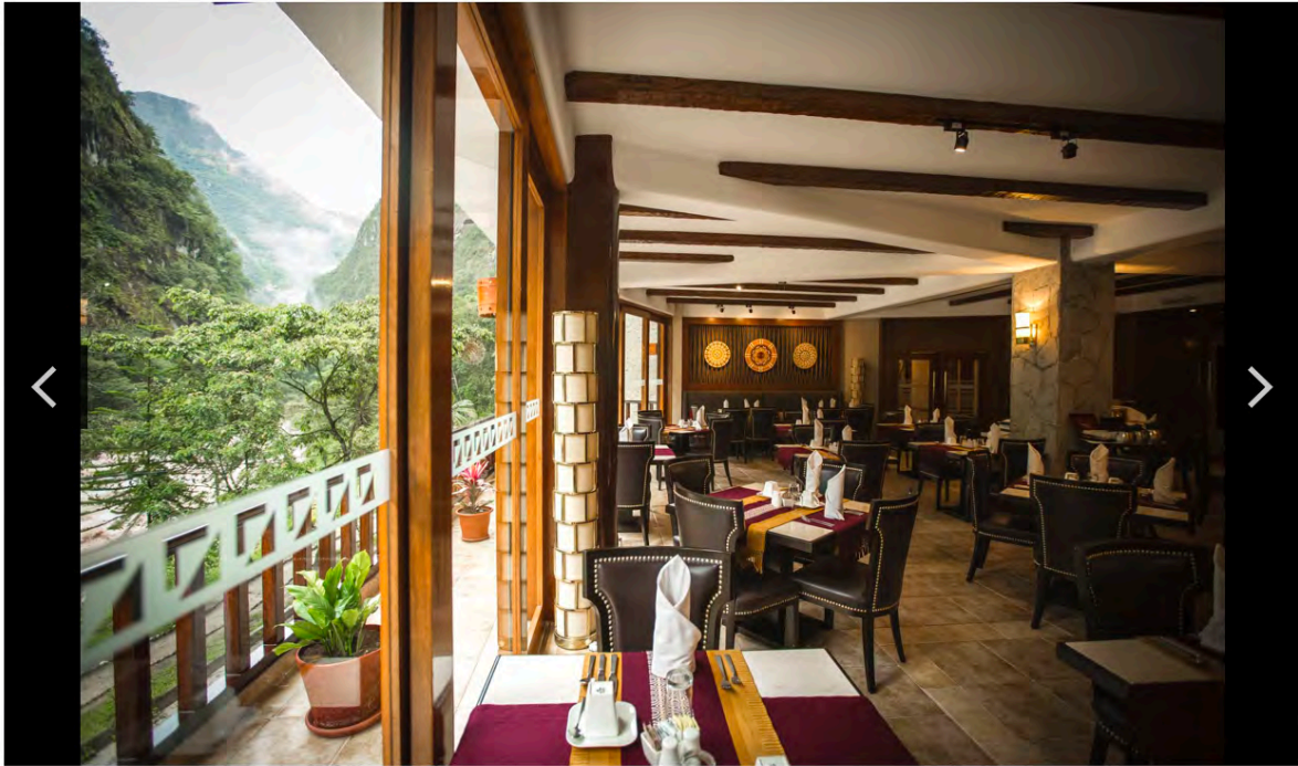
Qunuq is open for breakfast, lunch and dinner.