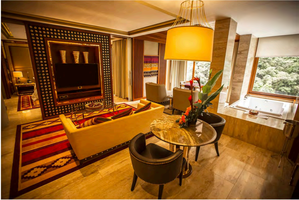
The über plush Imperial Suite is the most luxurious room at the hotel.