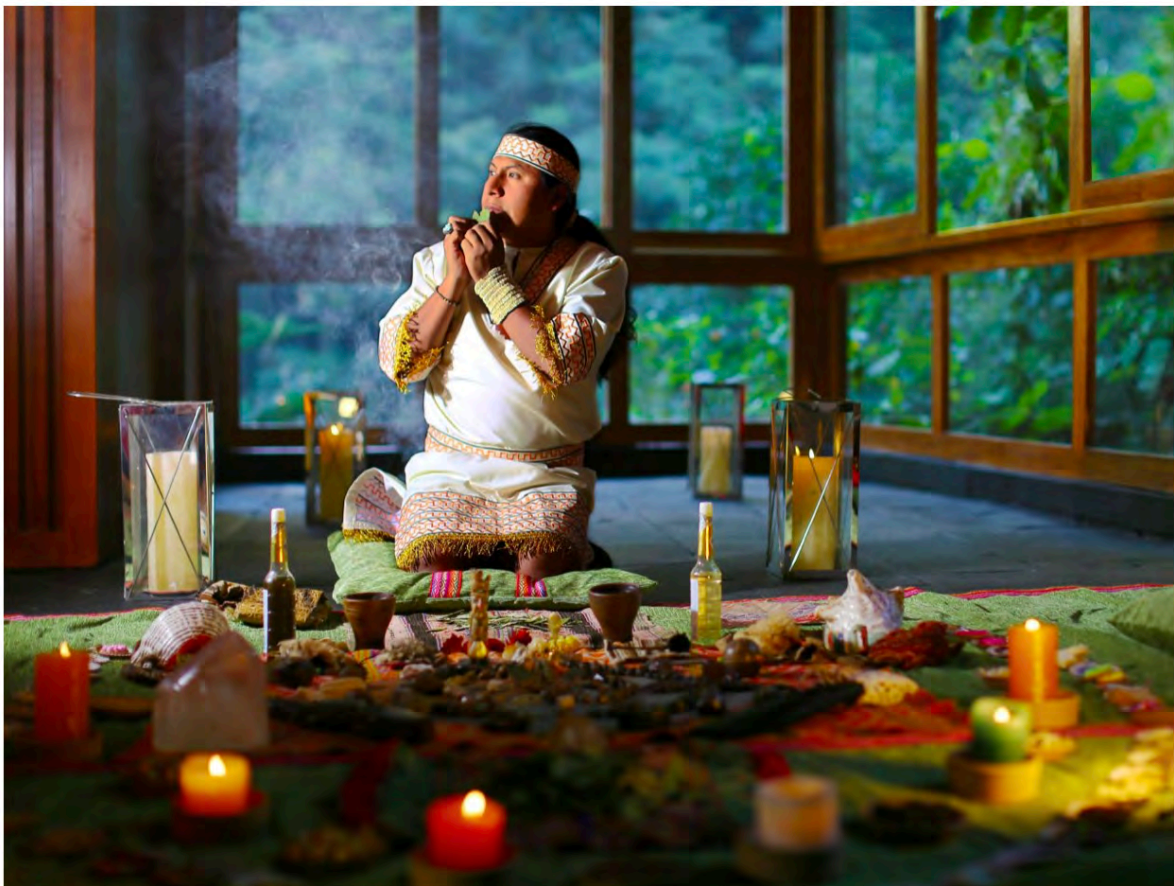
A shaman comes to the hotel for rituals and ceremonies.

Now, here's what you (and pretty much everyone else) planned your trip around—the actual Machu Picchu experience. Sumaq will take care of all the logistical planning, and they have a few different options for how you can see the magical site. On my recent trip to Machu Picchu, I embarked on the “Mystical Tour,” where you'll meet your private guide and shaman (yes, shaman, and no, this isn't gimmicky) before getting onto the bus that takes you up the mountain. The experience, which is a bit over five hours when you factor in travel to and from the site, is both historical and spiritual, and includes a ceremony at a sacred rock, cleansing ritual and, of course, plenty of background on the Incan citadel.