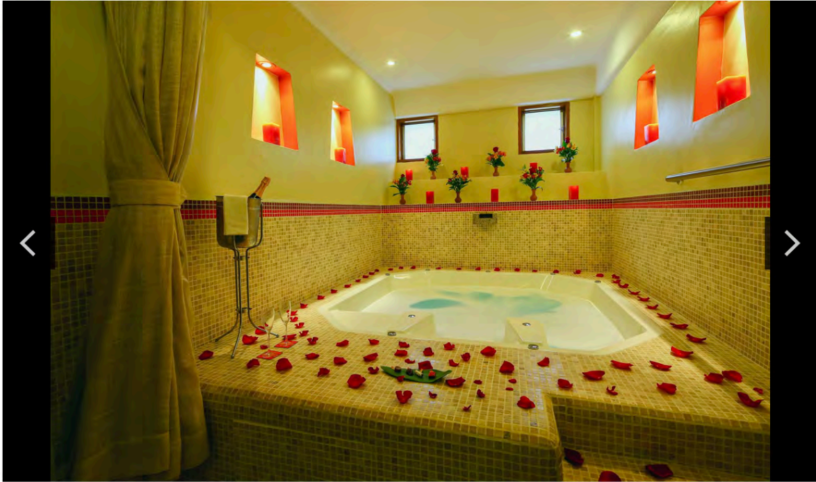
The Aqlla Spa.