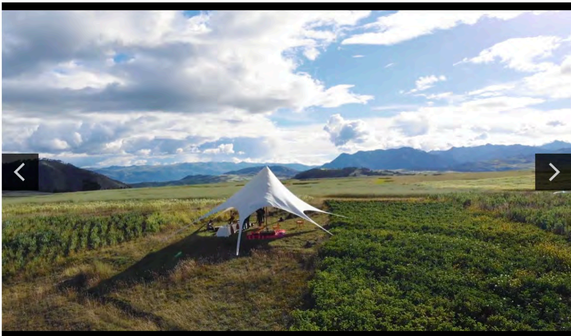
Guests can book a number of culinary experiences.