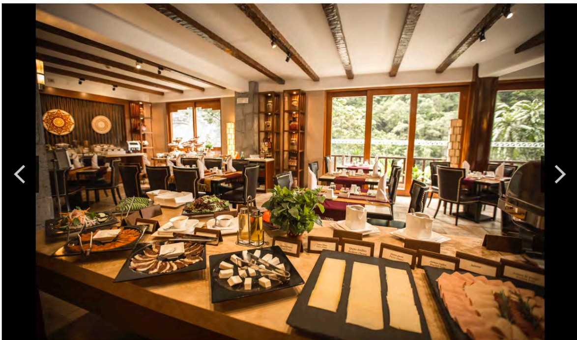
The dishes use local ingredients.